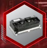
Drive Control Unit