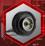
High performance in-wheel motors